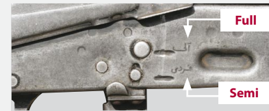
Model illustrated: Misr, Egypt

The fire selector is a lever that enables the user to switch between safe (up), fully automatic (centre), and semi-automatic (down) modes of operation.