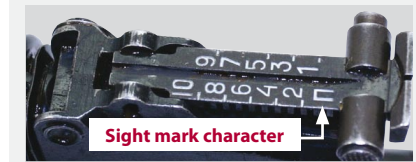
Model illustrated: AKM, Russia

Kalashnikov-pattern weapons feature a tangent rear sight, which is marked with various distance graduations. The zero mark (at the base and closest to the sight notch) usually features a character, which differs according to manufacturer / country of manufacture.